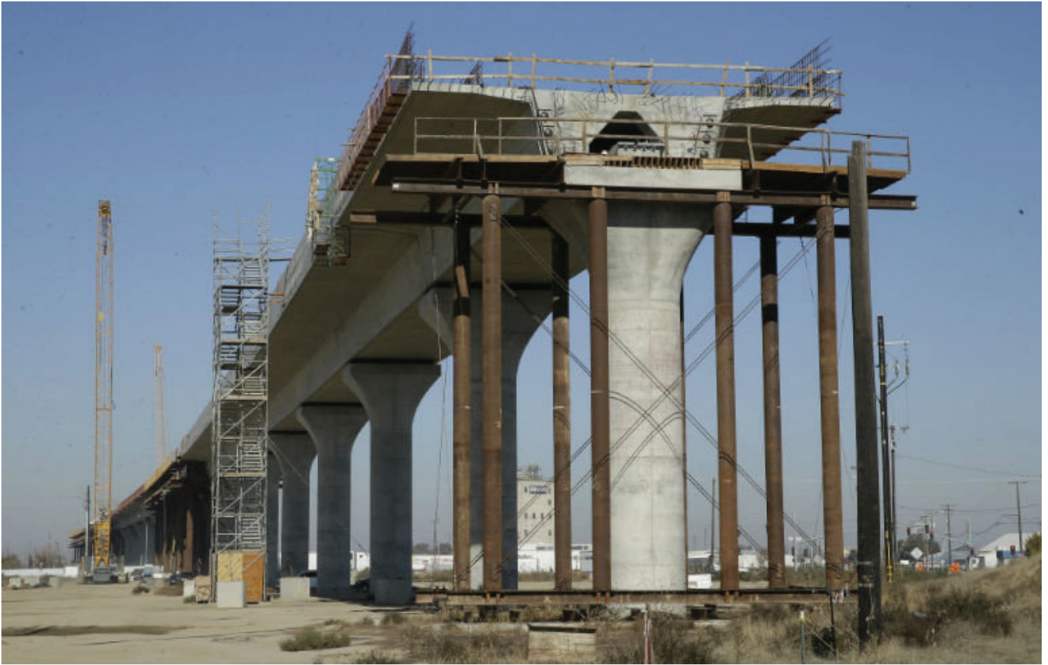
A section of the California high-speed rail system under construction near Fresno.